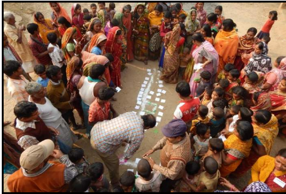
Triggering or Participatory Rural Appraisal

Similarly, coercive tools have to be avoided lest it should further alienate the community. At the most, the community may devise do's and don'ts for themselves and enforce internally. As long as such social pressure is exerted in a legal manner, the administration should not interfere with the initiatives taken by the community itself, nor be seen publicly advocating them.