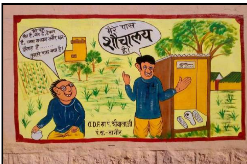
Wall writings / Painting

Focused BCC activities may be required to reach out to vulnerable and distantly located population, tribal, elderly, schedule caste habitations, nomads, forest dwellers, etc.