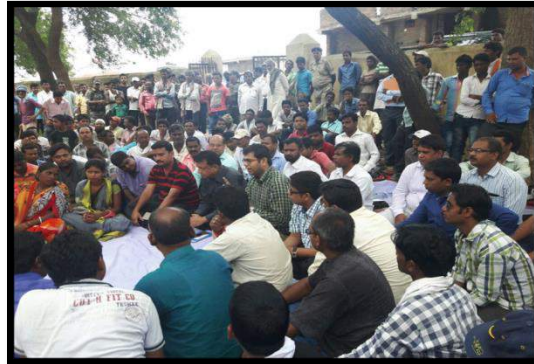
Awareness and Training Workshops