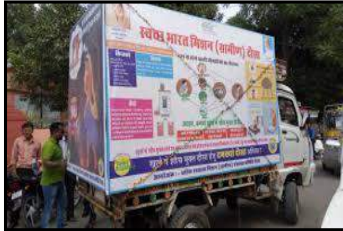
Swachhta Rath – Exhibition Van

12. Swachhta Rath: These are mobile exhibition vans which can be developed per district and can act like a travelling exhibition. They would contain all information about sanitation practices, toilet technology, printed, digital and audio visual communication material to impress upon the urgent need for behavior change w.r.t sanitation and hygiene.