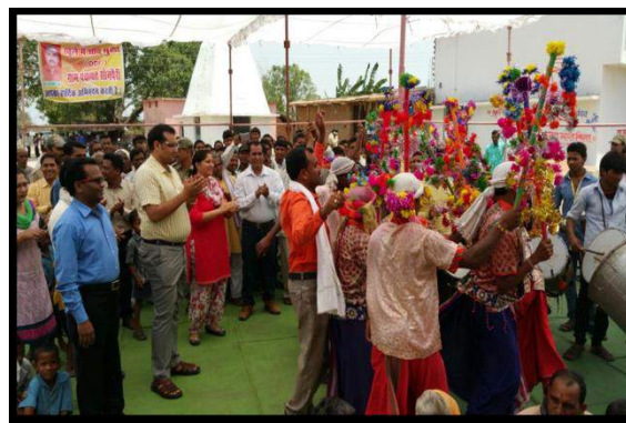
Awareness melas, song and dance as a means of generating awareness about sanitation