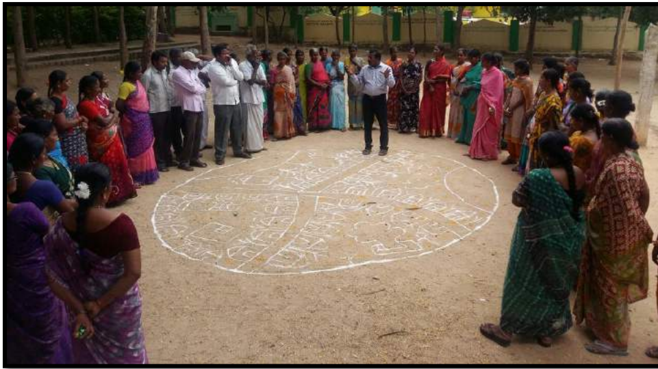
CAS Training of Swachhagrahis