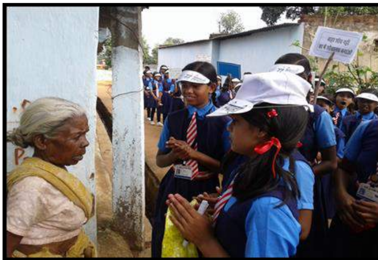
Swachhta and Schools –School children conducting IPC