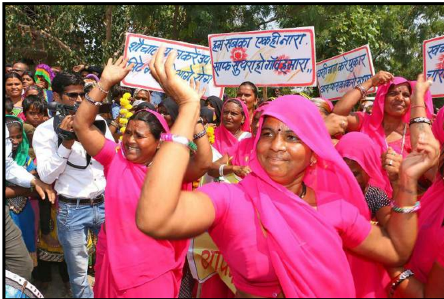
Hoardings and Banners being used in a Swachhta Rally

To be more impactful, IEC messages must appeal to human emotions, such as love for one's family, feelings of protectiveness and caring for one's children, social status and esteem, etc. instead of dry messaging highlighting only facts and figures. Elements of surprise and humour make a message stick much better in the minds of the community.