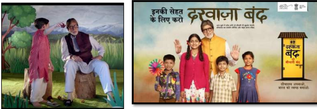
Mass Media Campaigns on TV/Radio